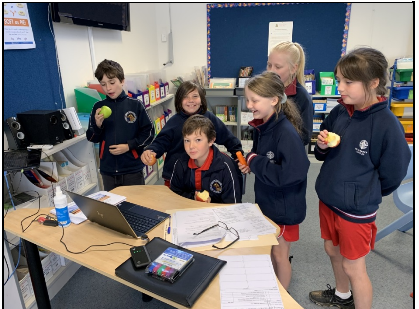
Year 5 students chat with their online friends during a brain food break

With the official return of face-to-face teaching at St Albert's, I wanted to pay tribute to our amazing staff who responded to the many demands placed on them in the closing weeks of Term One. There was so much uncertainty and so much change. Traditional teaching models were turned on their head and in a very short period of time, staff re-designed pedagogy and content to suit online delivery even though we had little to no experience with it, like most teachers across the country. We encountered some hiccups with the technology but quality teaching and learning prevailed. Your messages of support and encouragement during this time meant a lot; it kept us going and felt like a virtual pat on the back! We are very grateful to you.