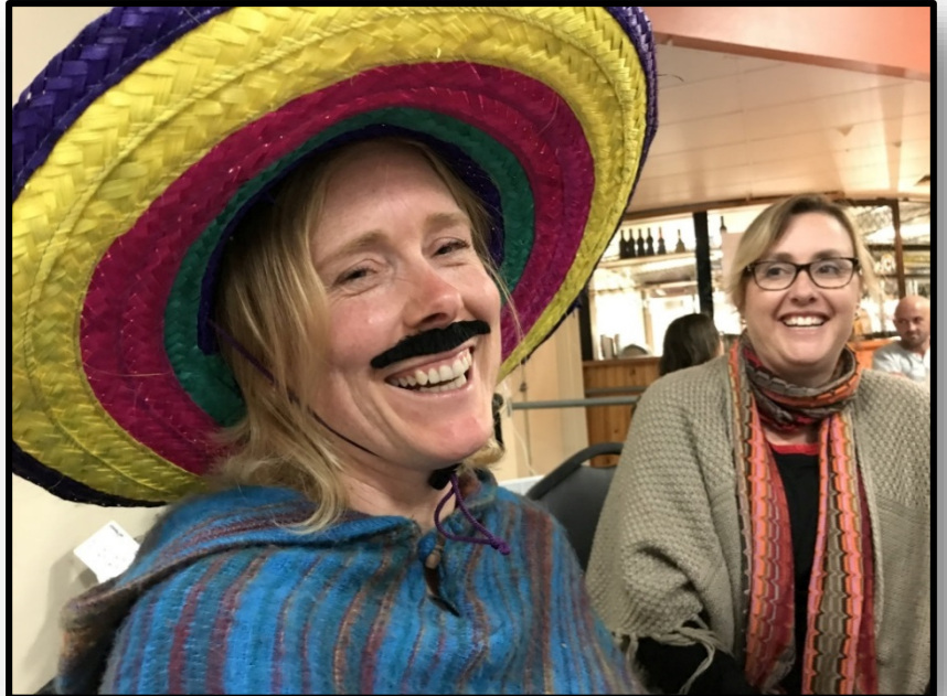
Reliving last year's hugely successful AWAD!