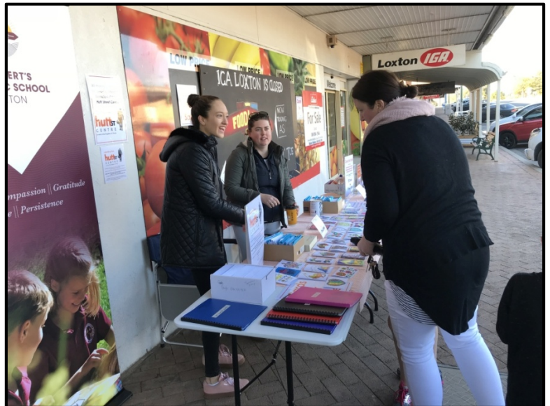
Money raised to feed hundreds at the Hutt St Centre

To help celebrate this occasion, students are welcome to dress casually as an Angel or Superhero on Monday, September 24 (Week 10). There is no charge and the casual day theme is optional (I appreciate that Book Week was not that long ago!).