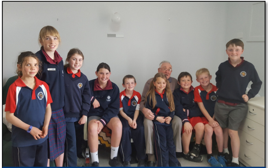
putting out into the deep